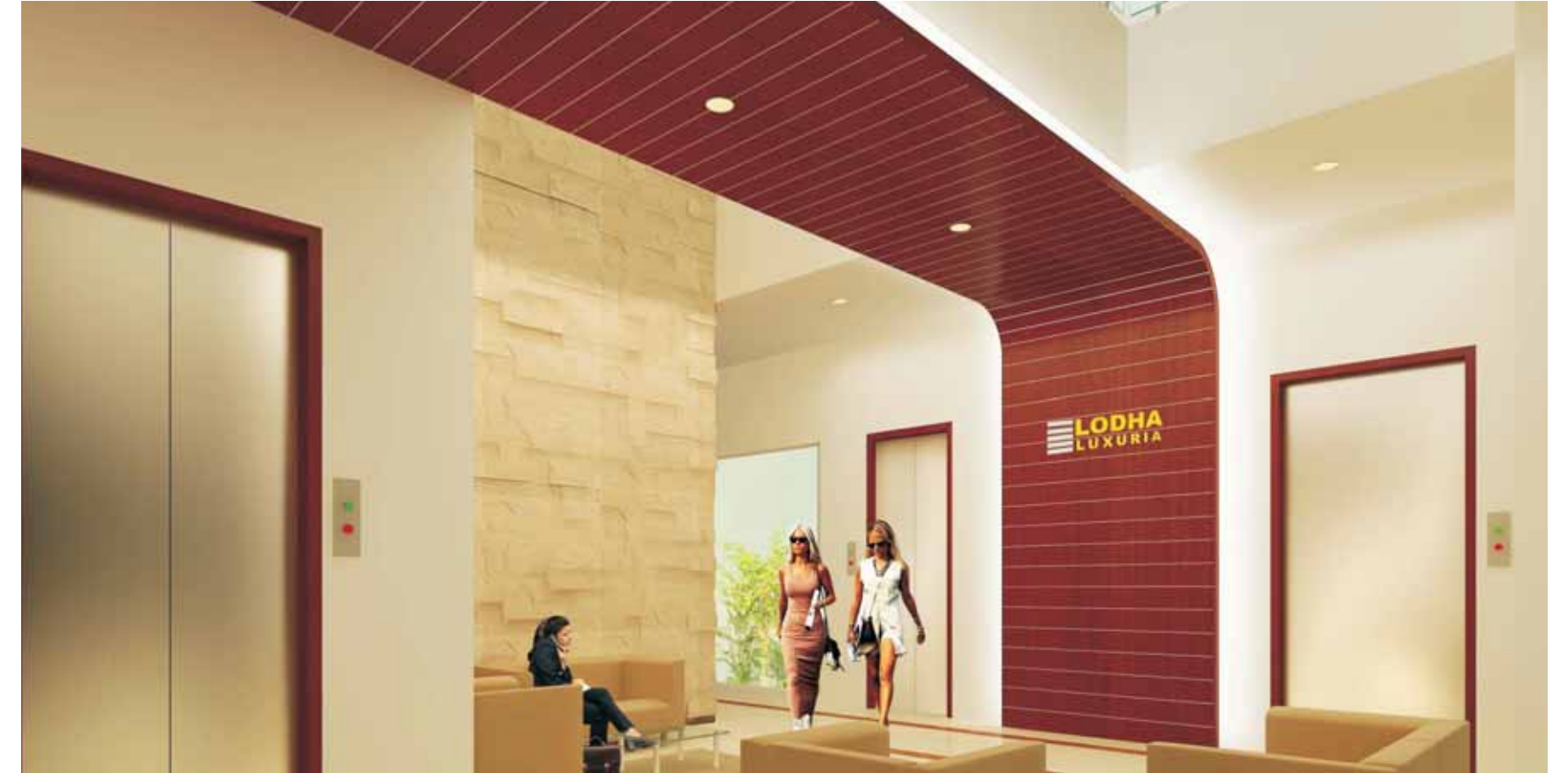
The air-conditioned double-height entrance lobby with elegant Italian marble flooring.