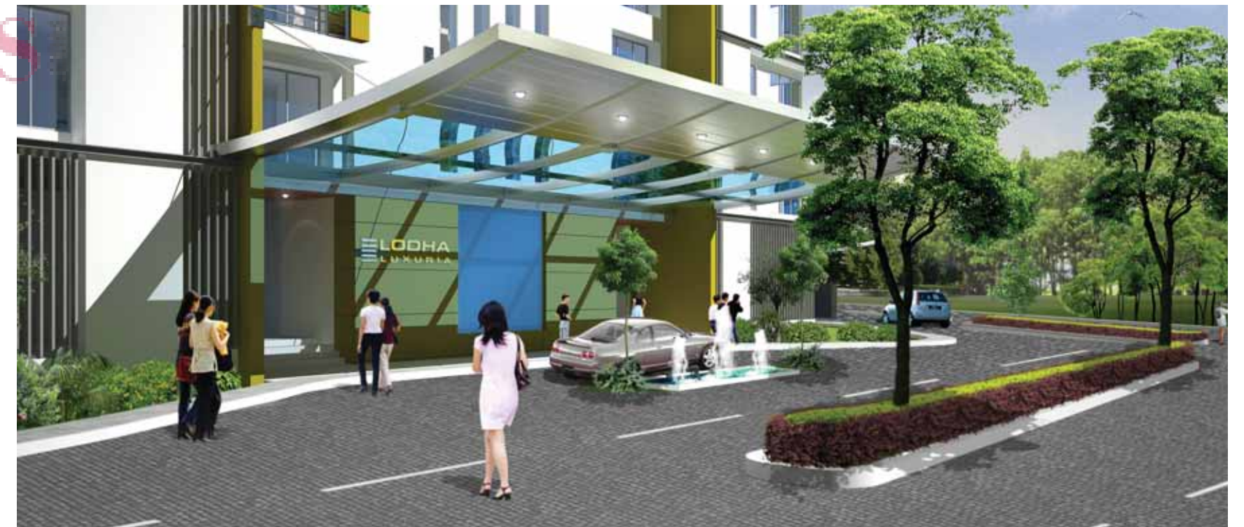
Every building has a separate drop-off, so you can drive the car right up to the lobby.