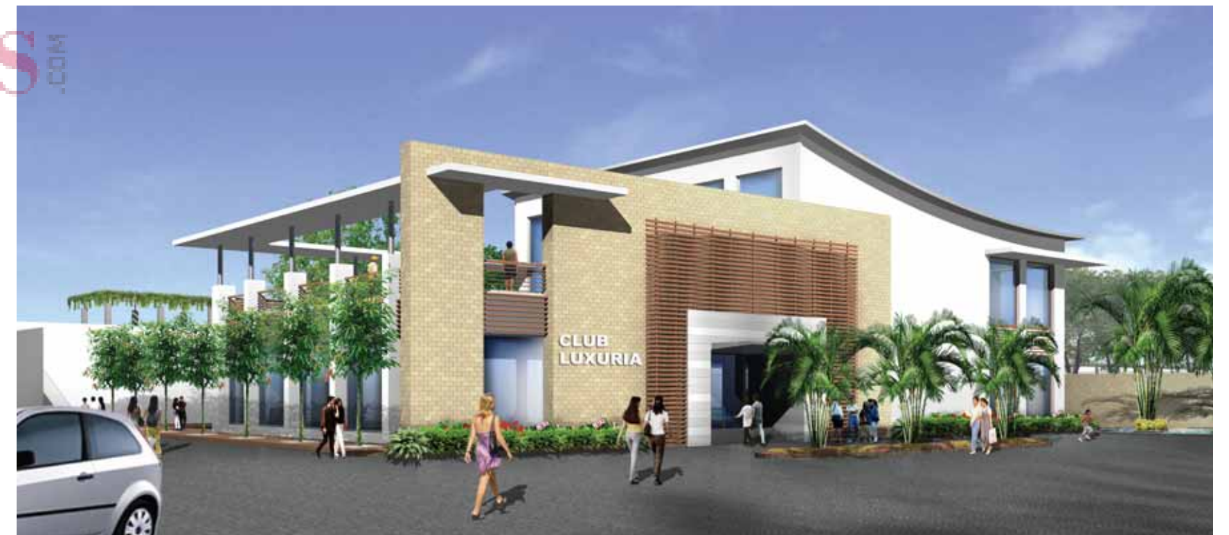
The clubhouse with pool, gym, indoor games, meditation room, KidzFun play area and business centre.