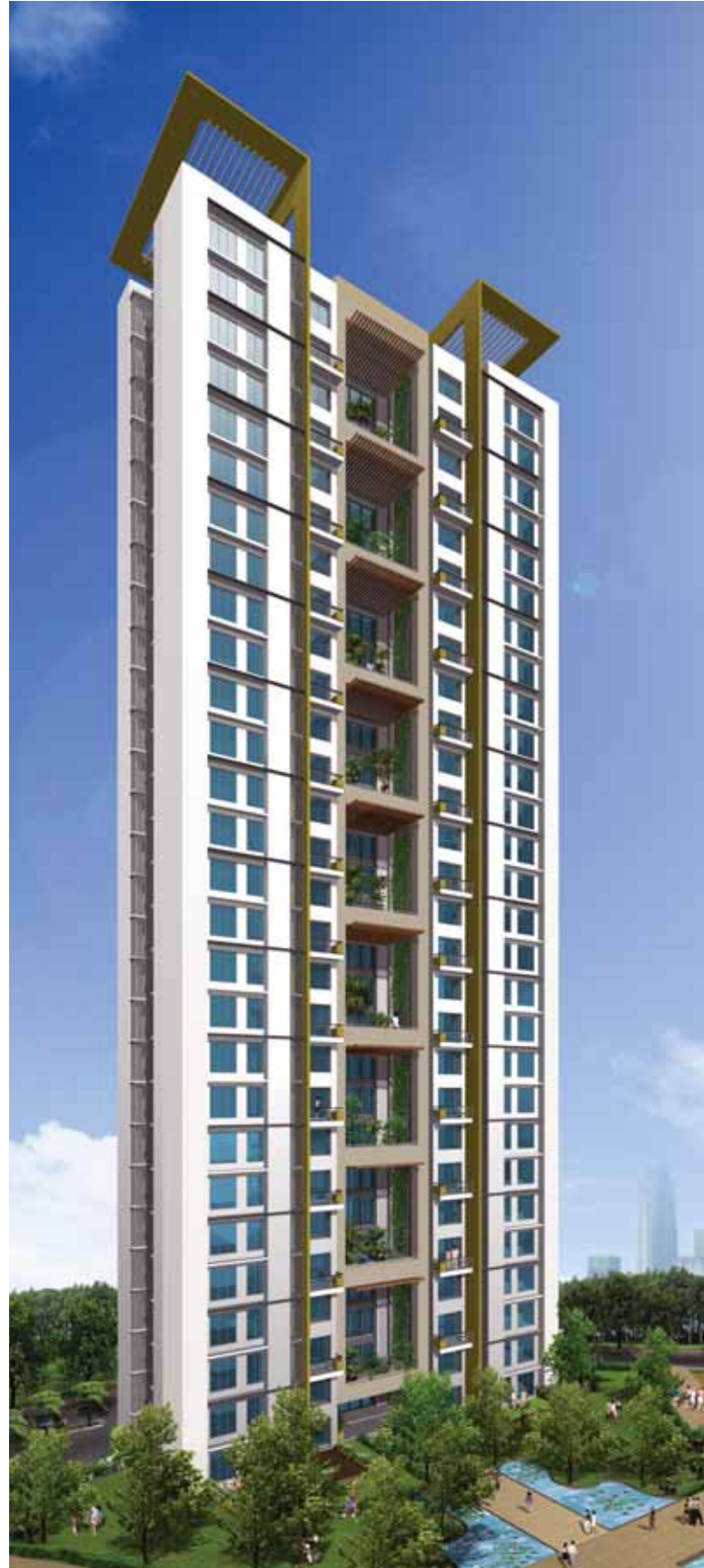
The 2BHK Prestige residences, surrounded by lush greenery.