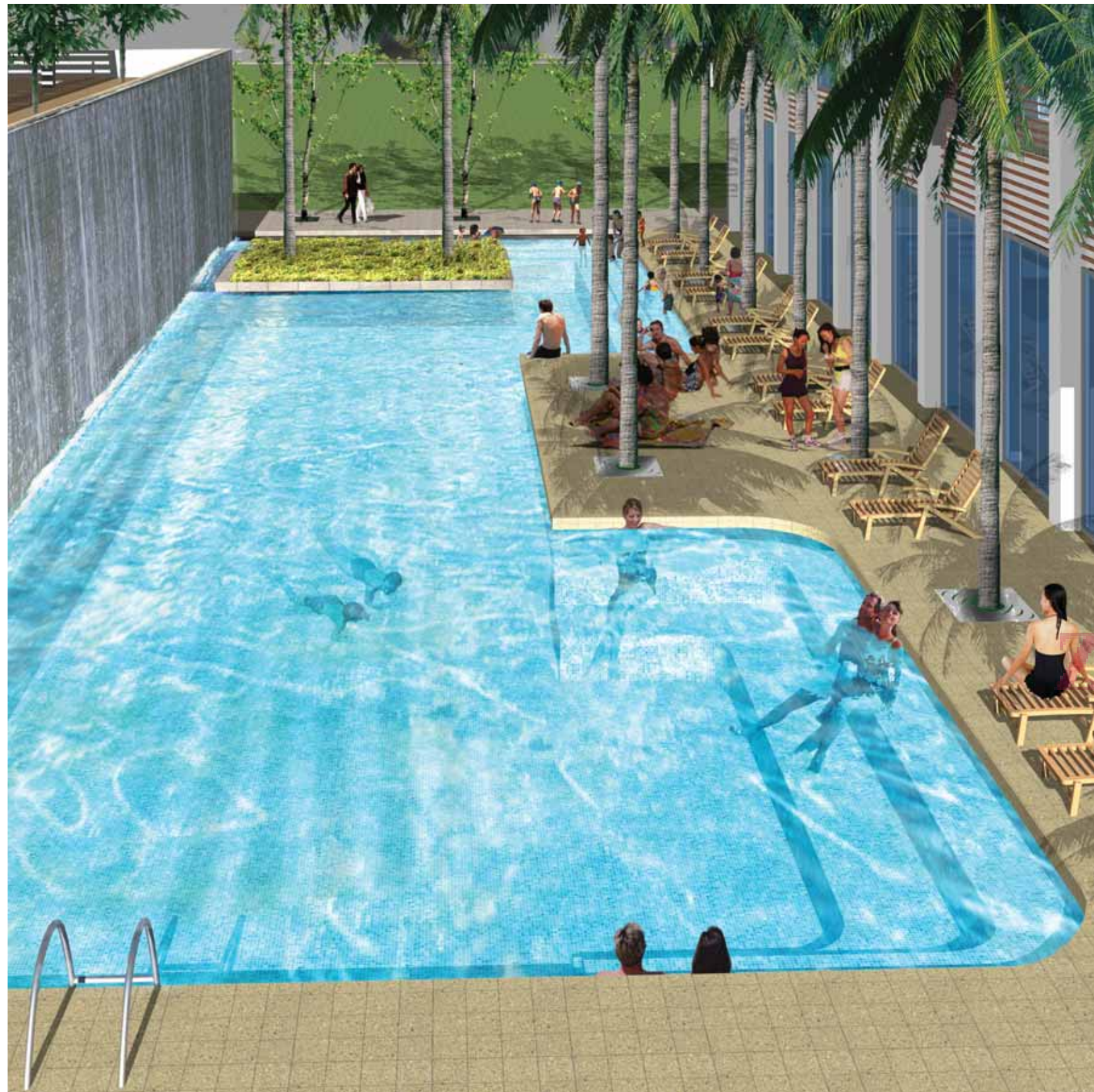
A closer look at the clubhouse swimming pool.