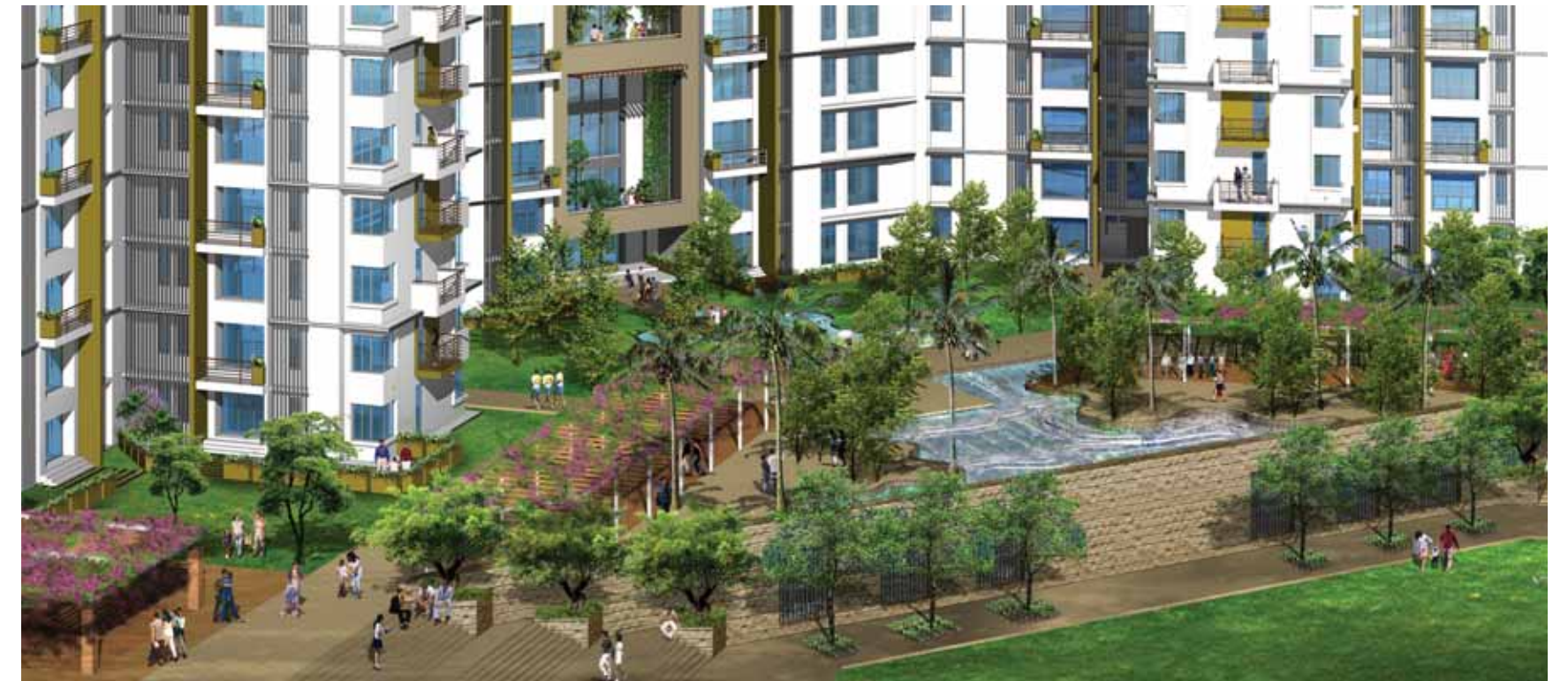
Landscaped, vehicle-free area with theme gardens, waterbodies and tree-lined walkways.